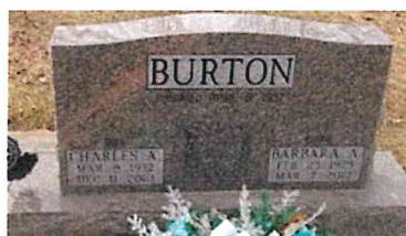
Added by RWCNAC